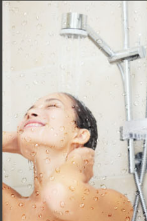
Guardian ShowerGuard® Coating