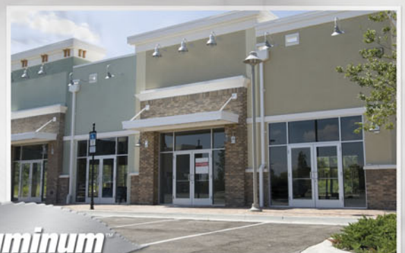
Product Made in the USA

EcoLuminum by TUBELITE More recycled content, eco-efficient finishes