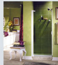
Pivot & Hinge Shower Door Models