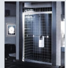
Sliding Shower Door Models