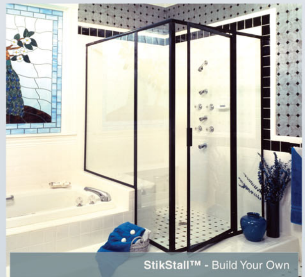
StikStall™ - Build Your Own