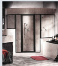
StikStall™ Shower Door Models