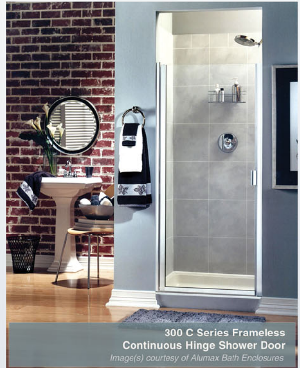
300 C Series Frameless Continuous Hinge Shower Door