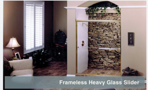
Frameless Heavy Glass Slider

Today's market calls for availability not limitations on every level of glass, hardware and design. With that in mind, Glaz-Tech Industries introduces Alumax Bath Enclosures . Glaz-Tech's integrated fabrication capabilities, alongside with Alumax's dynamic product line, gives you far more options for basic or highly complex designed enclosures. A shower enclosure's elegant presentation says a lot about the craftsmanship and the owner. Go with a certified distributor that fabricates quality product and provides endless ideas for even the simplest bath enclosure.