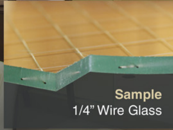
Sample 1/4" Wire Glass

GTI GLAZ-TECH INDUSTRIES DESIGN THROUGH GLASS